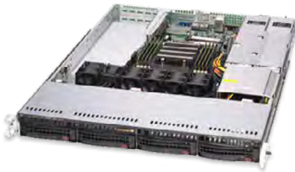
1U UP WIO