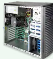
AS-3014TS-i Mid-Tower Single-Processor Server with 8 DIMMs, up to 3 GPUs