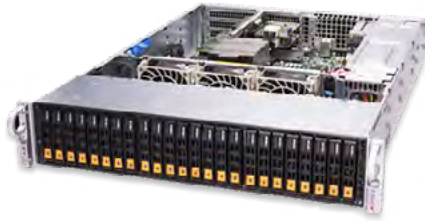
2U UP WIO