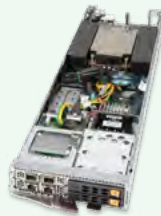
SBA-4114S-C2N SAS/SATA/NVMe Model (AIOM module)