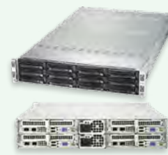
AS-2014TP-HTR 2U System with 4 hot-pluggable Single-Processor Server Nodes