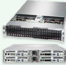
AS-2124BT-HTR 2U System with 4 hot-pluggable Dual-Processor Server Nodes with SATA