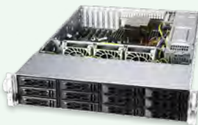
AS-2014S-TR 2U Single-Processor Server with 8 DIMMs