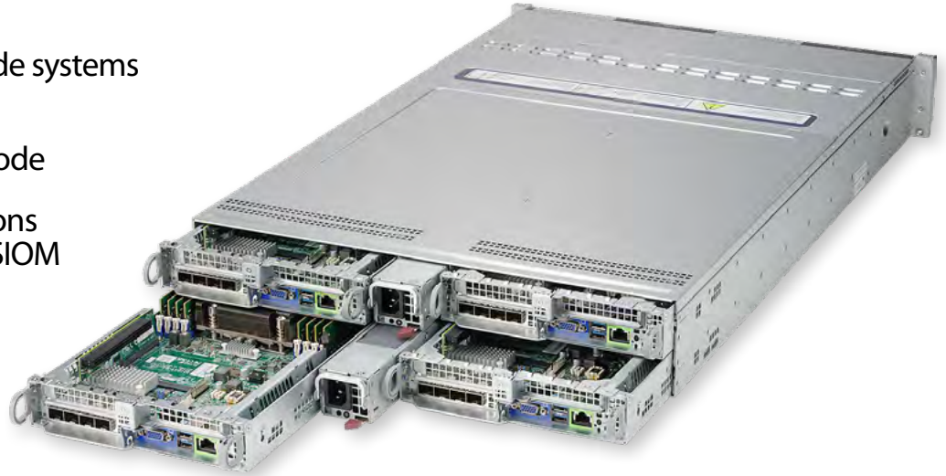
A+ BigTwin® (2U4N)

Flexible storage and I/O options including NVMe/SATA3 and SIOM networking