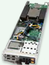
SBA-4114S-T2N SATA/NVMe Model (AIOM module)

Up to 20 Single Processor Nodes in 8U with 8 DIMMs and mezzanine card for advanced networking