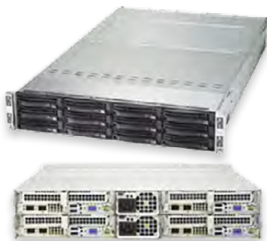
TwinPro® - 2U 4 UP Nodes