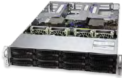
2U Ultra, 8TB DDR4