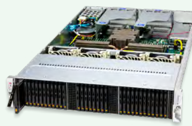
ASG-2115S-NE332R 32 EDSFF (E3 7.5mm NVMe SSD)