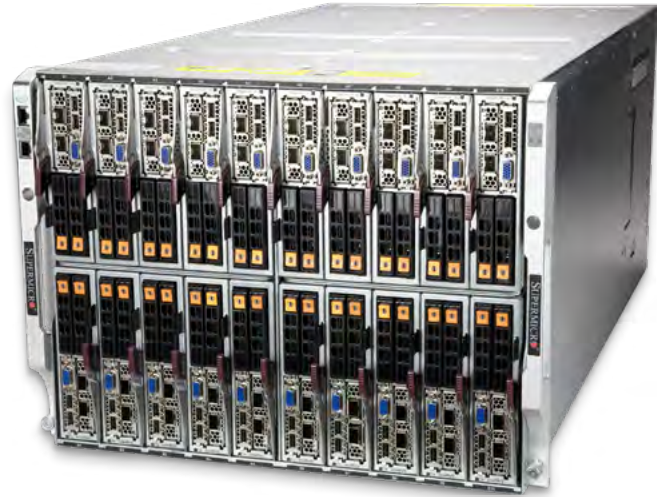
SBE-820C/H/L/J (Front View)

Integrated HPC network fabrics for up to 200G HDR InfiniBand with 100% non-blocking switch