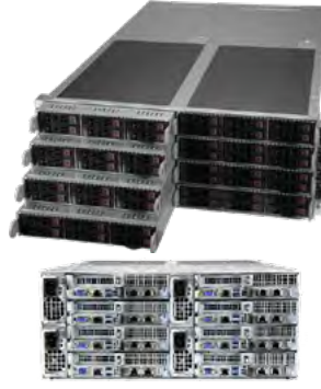
8 Nodes, Rear IO