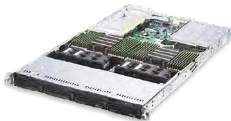
1U Ultra, 8TB DDR4