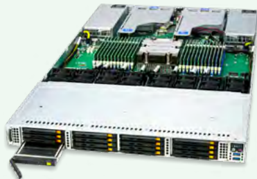
ASG-1115S-NE316R 16 EDSFF (E3 7.5mm NVMe SSD)