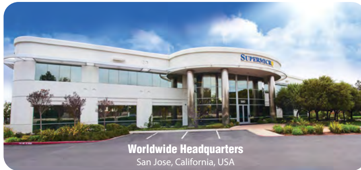
Worldwide Headquarters San Jose, California, USA

Providing Greater Economies of Scale and Accelerated Support to Data Center, Cloud Computing, AI, Enterprise IT, HPC, 5G, Hyperscale, and Embedded Solutions Customers Worldwide