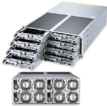
8 Nodes, Front I/O