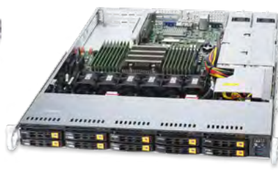
1U 10NVMe, UP WIO