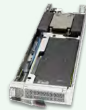
SBA-4119SG GPU Model with 2 GPUs, M.2 NVMe