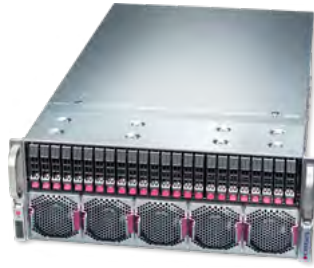
4U Quad APU System