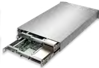
2U 2-Node, 4-GPU with PCIe