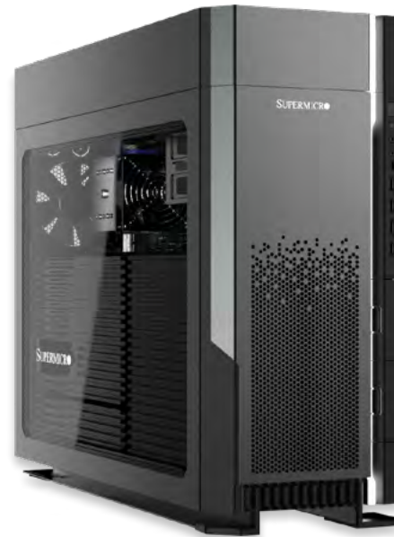
SuperWorkstation 5U Rackmountable/Tower AS-5014A-TT

A rich selection of storage options, AOCs, CPU TDP and memory speed support