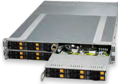
2U 4-Node Rear I/O