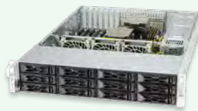
AS-2024S-TR 2U Dual-Processor with 16 DIMMs