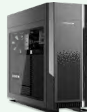
SuperWorkstation AS-5014A-TT AMD Ryzen™ Threadripper™ PRO 3000WX Series Processor with 8 DIMMs, 6 PCIe x16 and dual 10GbE