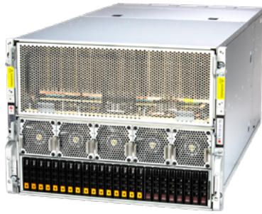
8U 8-GPU System