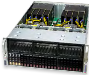
4U 8-GPU with PCIe