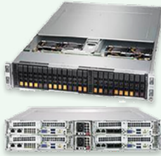
AS-2124BT-HNTR 2U System with 4 hot-pluggable Dual-Processor Server Nodes with U.2 NVMe