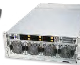
4U 8-GPU with HGX