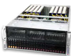
4U 8-GPU with PCIe