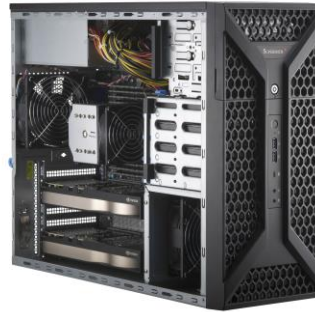
Supernano SuperWorkstation SYS-531A-I