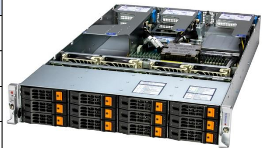
Fig. 3 Hyper A+ Server AS -2015HS-TNR