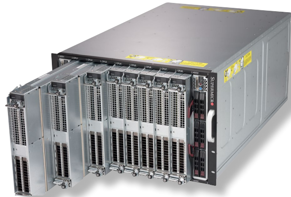
Figure 1. Supermicro 7U 8-way Reference Architecture for DWFT 2016

The Reference Architecture features 8 Intel® Xeon® processor E7-8890 v4 (formerly Broadwell) CPUs with 192 cores, 4TB system memory, and 16 NVMe SSDs totaling 32TB of storage capacity, and is certified to be sufficient to host a 90TB data warehouse instance with the fastest row store measured I/O throughput ever certified.