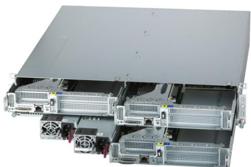
Figure 1 - Supermicro Edge System – 2U 3 Node Front Access Short Depth Server