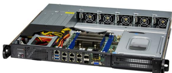
Figure 2 - Supermicro Edge Server - Intel(R) Xeon Processor D-2796NT Embedded System