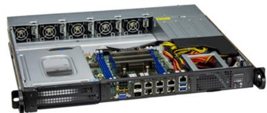
Supermicro Telecoms Edge Infrastructure Solutions