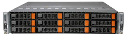
Fig. 3 BigTwin SuperServer SYS-621BT-DNC8R