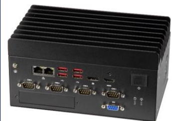
SYS-E100-9W-IA-E powered by acix