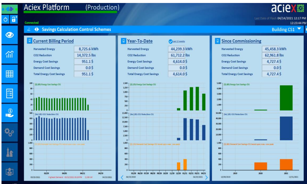
Acix Platform - Calculated Savings Interface