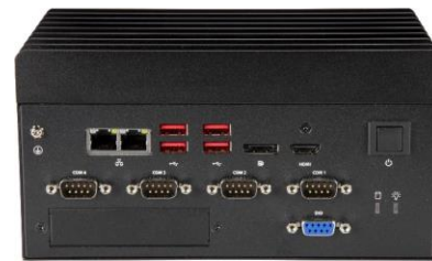
Supermicro's Fanless IoT Gateways teamed with EMACX's AcieX Platform