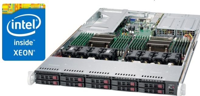
Figure 1: Supermicro 1U Ultra (SYS-1028U-TR4+)

tier competitive suppliers were also tested. All four servers support the latest Intel® Xeon® processor E5-2600 v3 product family, 24 DIMMs of memory, and 8x to 10x 2.5” drive bays. The configurations of the systems tested are outlined in Table 1. Identical CPUs, memory, and SSDs were used for the testing. BIOS settings and test environments were also identical except as noted.