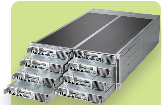
Supermicro FatTwin™ SYS-F617R3-FT

The power utilization of the Supermicro FatTwin™, 2U Twin 2 ®, and H2312WPJR systems were measured under identical operating conditions and configurations, utilizing the High Performance LINPACK (HPL) benchmark. Continuous power measurements of idle, average, and peak power values were recorded via power meters. From the measurement results, the Supermicro FatTwin™ and 2U Twin 2 ® power savings were calculated.