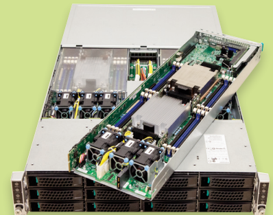
Competitor's System H2312WPJR