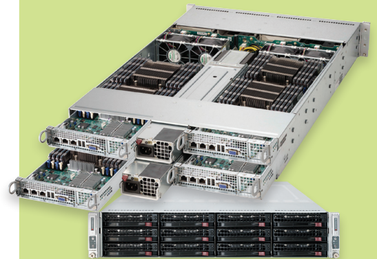
Supermicro 2U Twin²® SYS-6027TR-HTRF+