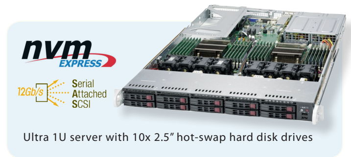
Ultra 1U server with 10x 2.5" hot-swap hard disk drives

center and enterprise environments. Ultra can handle a wide variety of robust computing workloads, with support for dual Intel® Xeon® E5-2600 v3 CPUs up to 36 cores, 1.5TB DDR4-2133MHz in 24 DIMMs and up to 180W per CPU 2 . This combination of large onboard memory, high core count CPUs, and low latency NVMe caching, make this a best-in-class offering for virtualization.