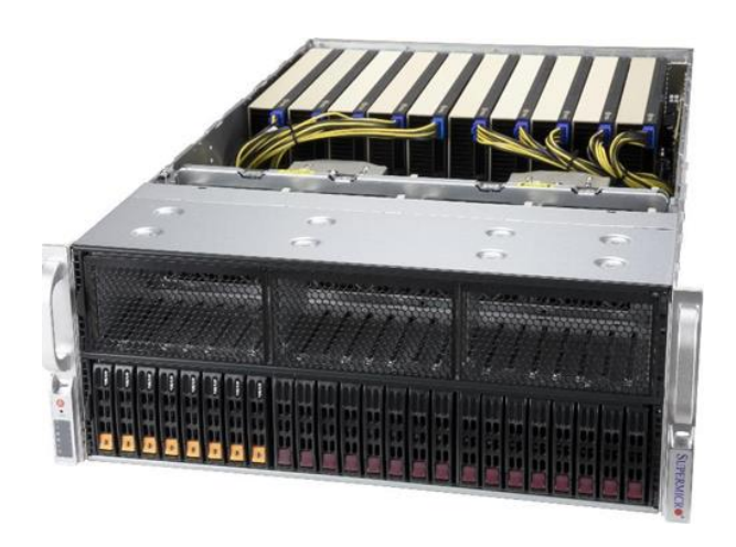
GPU System w/PCI-E

GPU Systems with PCI-E will benefit significantly from the PCI-E 4.0 communications bus, the increased number of cores, and the six TB to 12 TB memory per CPU for large applications.