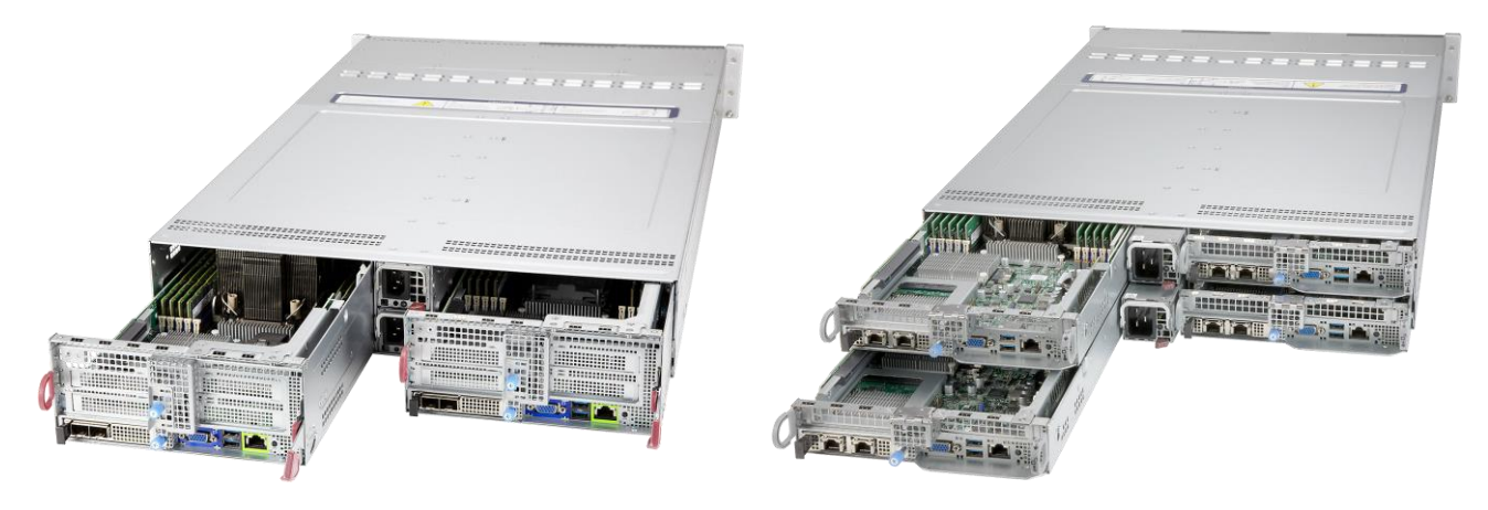
BigTwin w/2 Nodes

The 3<sup>rd</sup> Gen Intel Xeon Scalable processors' best features include more cores, higher clock cycles, two 512-bit FMA units, new Al-optimized instruction sets, increased memory size, SGX support, and PCI-E 4.0 NVMe storage & I/O performance.