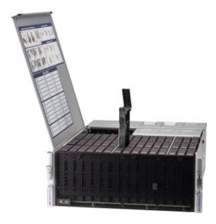
90 Bay SuperStorage System

The SuperStorage systems will benefit from the increased clock rates and PCI-E 4.0 I/O speeds with the 3<sup>rd</sup> Gen Intel Xeon Scalable processors.