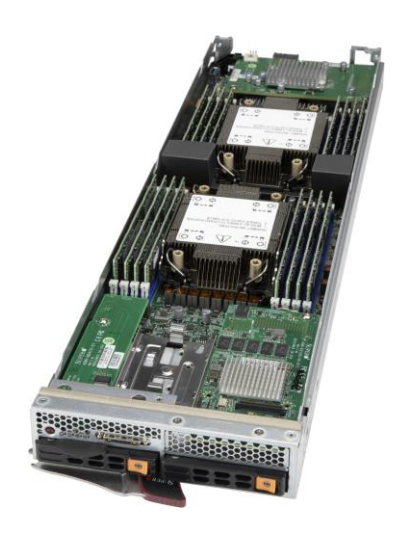
2 Socket Blade