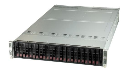
TwinPro w/4 Nodes

TwinPro® systems will excel when utilizing the new 3<sup>rd</sup> Gen Intel Xeon Scalable processor features, specifically the increased core count and clock rates, faster communication through PCI-E 4.0, larger memory addressability, and support for single-socket or dual-socket configurations to deliver cost-optimized performance with Dual-10G ethernet onboard.