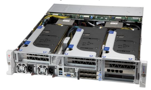
2U Hyper / Hyper-E

Hyper and Hyper-E systems will benefit from the increased core count at similar pricing with the 3<sup>rd</sup> Gen Intel Xeon Scalable processors. The faster PCI-E 4.0 communications bus will give more rapid access to storage devices