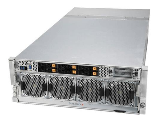
GPU with HGX

For the Supermicro GPU systems, all of the new features of the 3<sup>rd</sup> Gen Intel Xeon Scalable processors will help high-end applications perform better and return faster with the latest GPU systems from Supermicro. More and faster cores, higher bandwidth to the GPUs and other devices, and the ability to address vast amounts of memory are exactly what large HPC and AI applications demand.