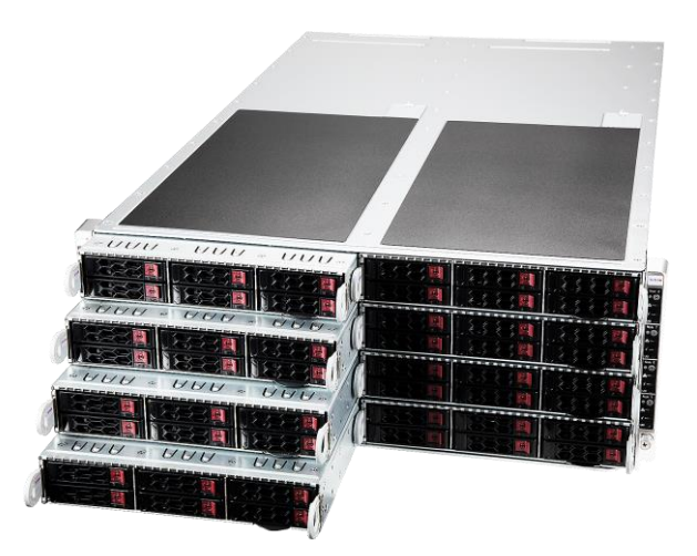
FatTwin w/4 Nodes