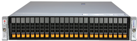
2U A+ Server 2115HS-TNR (NVMe/SAS/SATA)