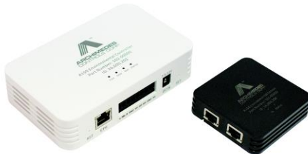
A150 Controller & A150 Sensor

Supermicro's SYS-E100-12T Edge Server and Archimedes Controls' A150 Wireless IoT Sensors and Controller