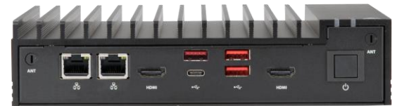
Supermicro's IoT Gateway Servers Teamed with Archimedes A150 System