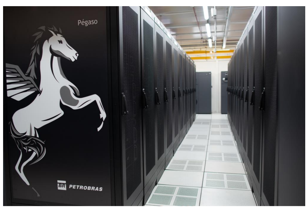
Figure 1 - Pegaso Supercomputer with Supermicro Servers

cluster consists of over 250 servers and is ranked #33 on the Top 500 list of the fastest computer systems available in the world today<sup>1</sup>. Each computing system contains 2TB of memory and is connected via an InfiniBand HDR networking system, running at 200Gb/s, allowing a wide range of applications to be run that takes advantage of many systems at once.