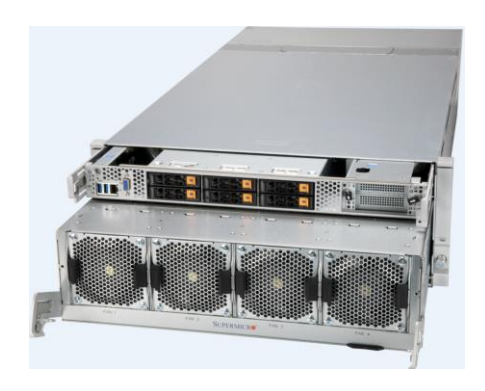
Supermicro SuperServer AS -4214GO-NART+

Petrobras' IT team worked closely with ATOS to integrate several Supermicro servers for their latest cluster, named Pégaso. This large