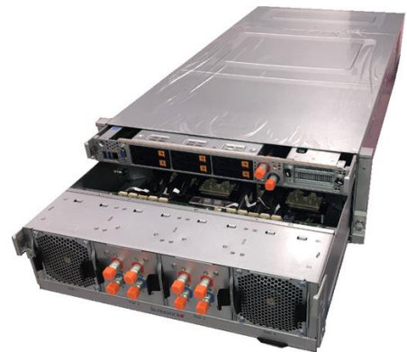
GPU System with DLC