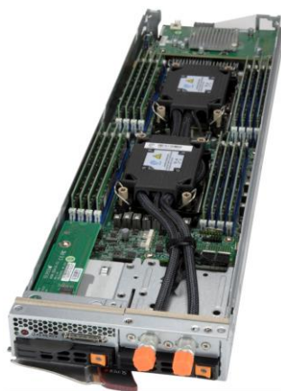
SuperBlade with DLC

The total deployment is 27 complete racks which were all assembled, integrated, and tested at the Supermicro factory and then directly shipped to Osaka University. Below is a table that summarizes the different nodes in the Squid supercomputing system.