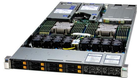
Fig. 3 Hyper A+ Server AS -1126HS-TN