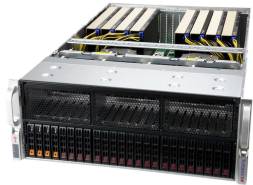
Fig. 3 1. GPU A+ Server AS -4125GS-TNRT