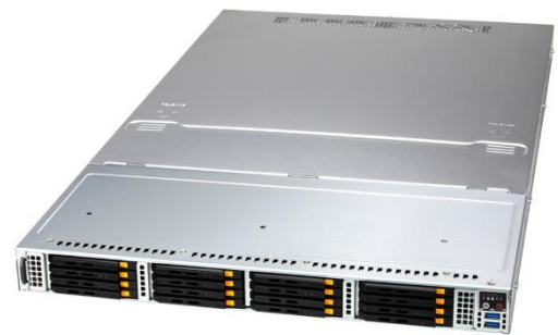
Fig. 3 Storage A+ Server ASG-1115S-NE316R