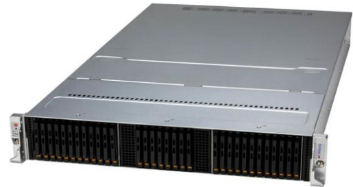
Fig. 3 Storage A+ Server ASG-2115S-NE332R