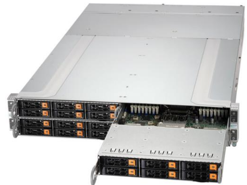
Fig. 3 GrandTwin SuperServer SYS-221GT-HNTR