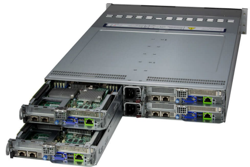
Fig. 3 1. BigTwin SuperServer SYS-221BT-HNR