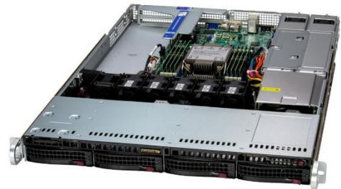
Fig. 3 WIO SuperServer SYS-512B-WR