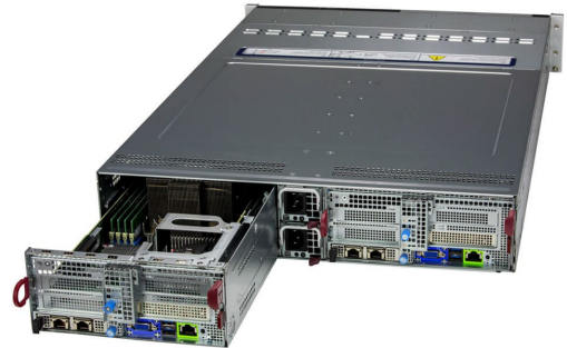
Fig. 3 1. BigTwin SuperServer SYS-621BT-DNTR