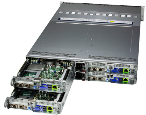
Fig. 3 1. BigTwin SuperServer SYS-621BT-HNTR