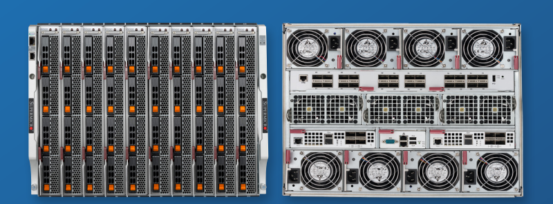
8U SBE-820 series enclosure supporting up to 10x 4-socket blade servers