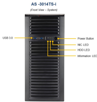
© Super Micro Computer, Inc. Information in this document is subject to change without notice.