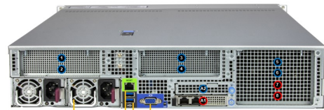
(Rear View – System)

1 NVMe, SAS3, and SATA3 support requires additional parts from the optional parts list