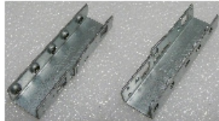
bracket A and B