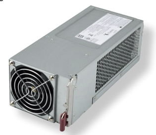
PWS-1K20B-BR: 1200W BBP Module