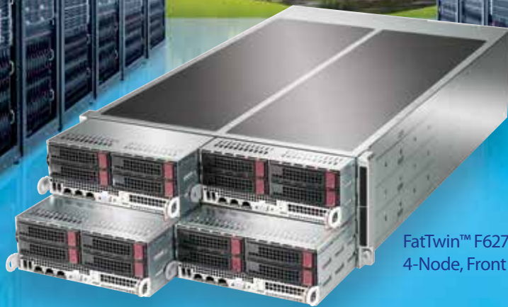
FatTwin™ F627R3-FT 4-Node, Front I/O