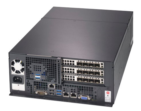
Figure 3. E403-9P-FN2T for deployment in more demanding environments