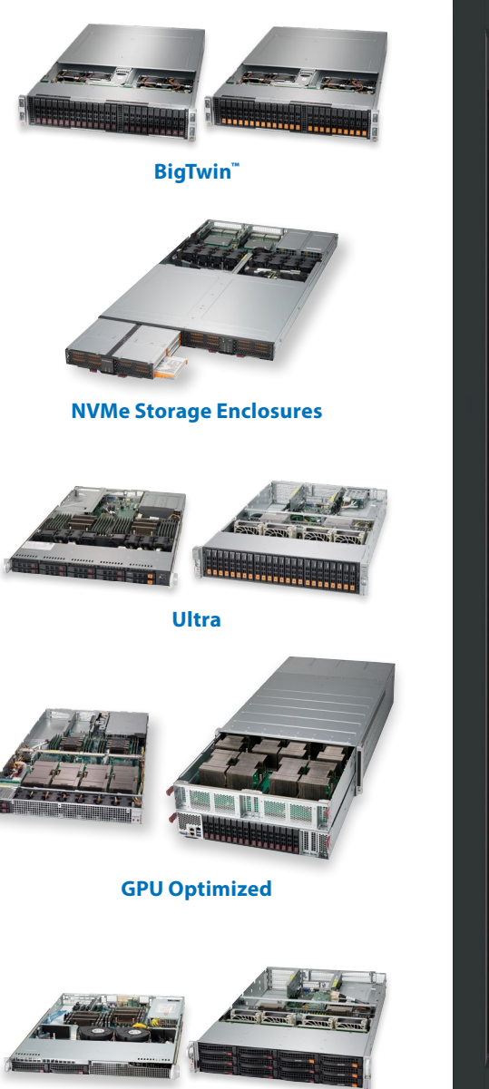
Datacenter Optimized Systems