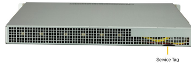
(Rear View – System)