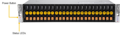
(Front View – System)